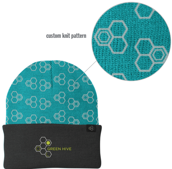
custom knit pattern