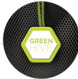
custom zipper pulls

TO LEARN MORE, CONTACT YOUR SALES REP TODAY.