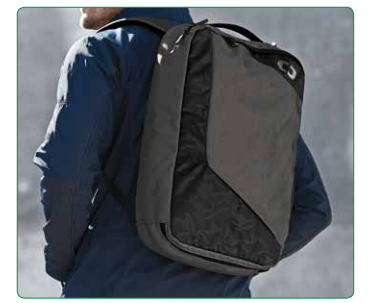
SHOULDER BAG CONVERTS TO A BACKPACK